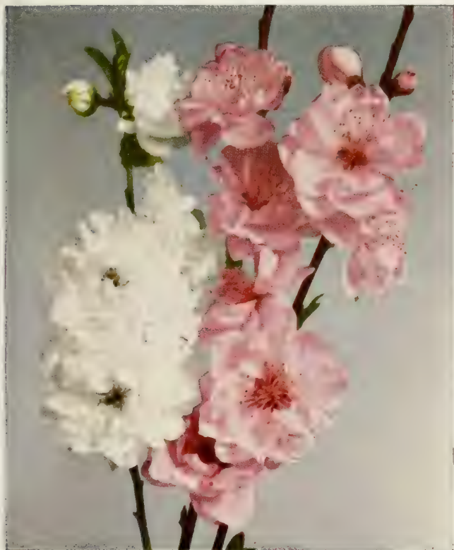
FLOWERING PEACHES: WHITE AND PINK

For Varieties and Prices—See Pages 24-25-26